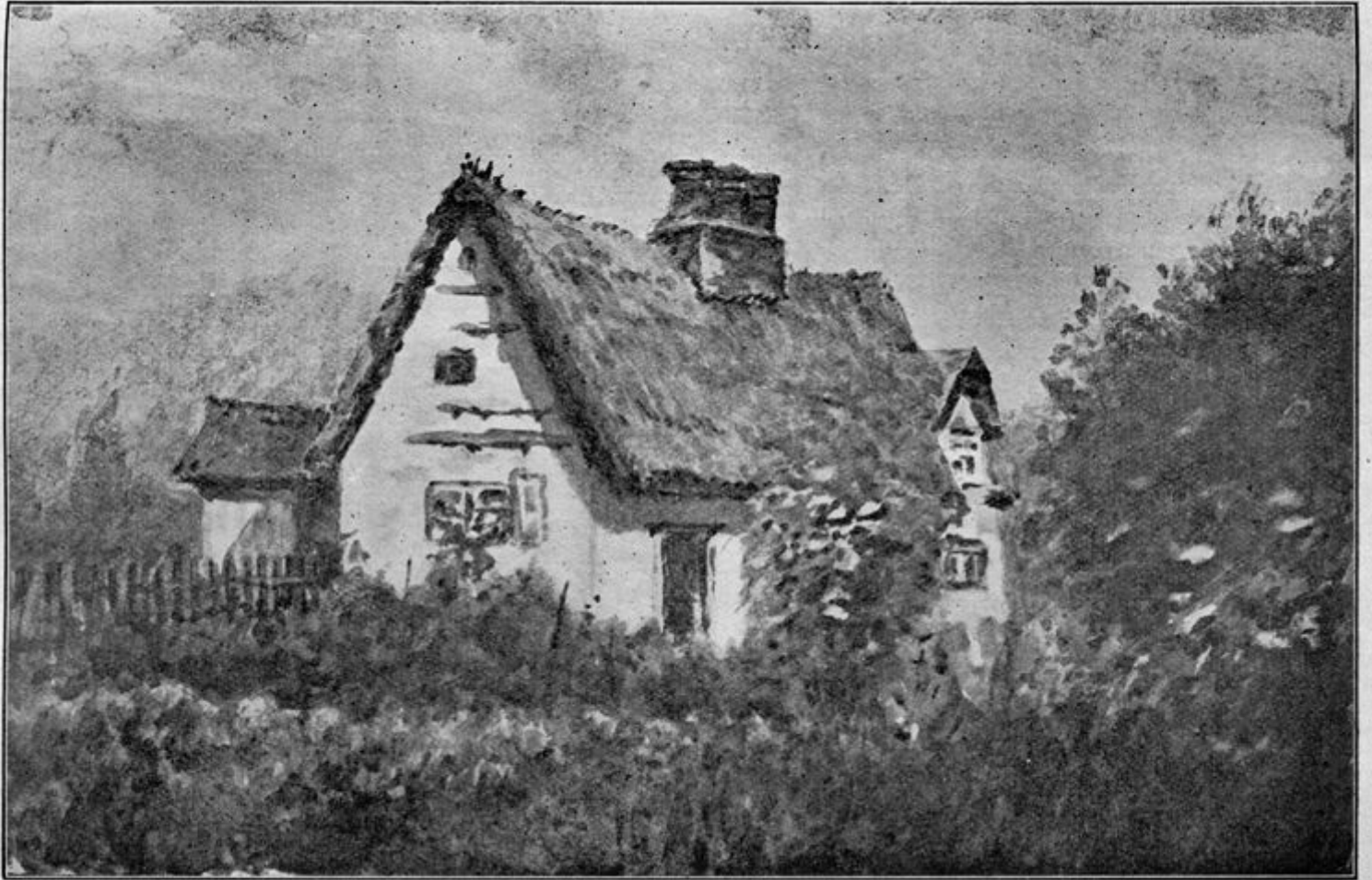
THE COTTAGE AT TEVERSHAM WHERE THE FIRST SERMON WAS PREACHED.