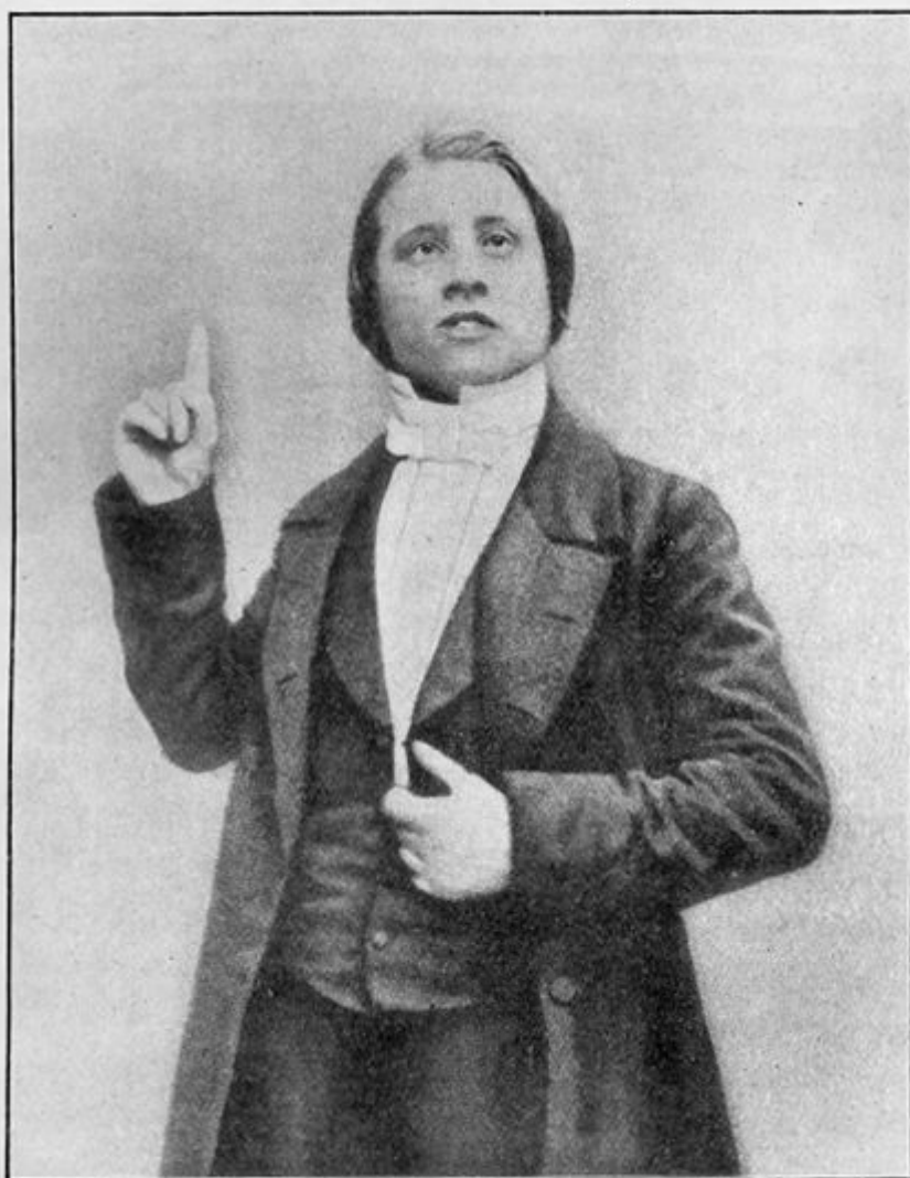
C. H. SPURGEON: AN EARLY PORTRAIT.