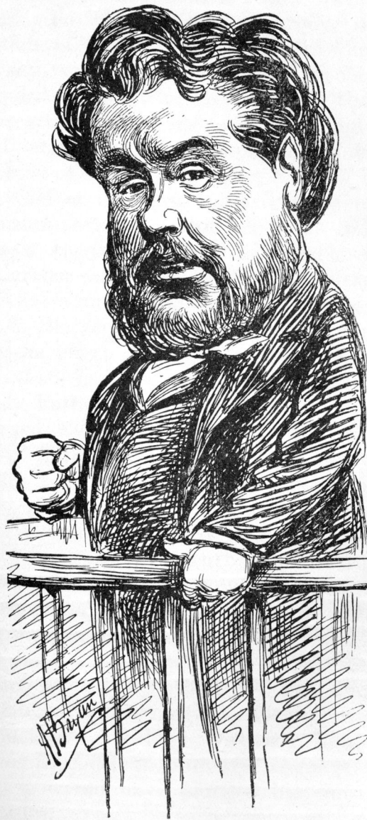
A CONTEMPORARY CARTOON. (From a drawing in "The Hornet.")