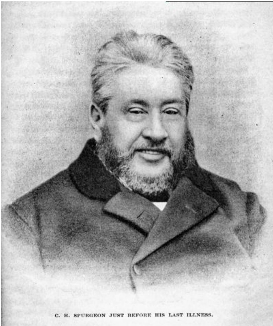
C. H. SPURGEON JUST BEFORE HIS LAST ILLNESS.