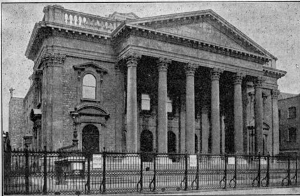
EXTERIOR THE METROPOLITAN TABERNACLE.